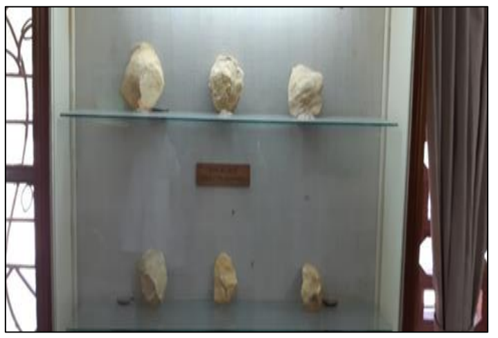
Fig. 6: Artifacts and ornaments at museum