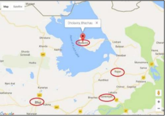
Fig. 1: Map of Bhuj