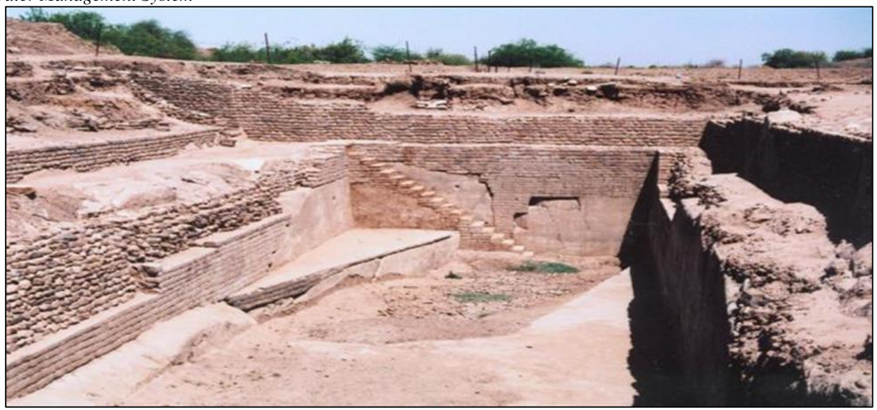
Fig. 4: Reservoir

One of the unique features of Dholavira archeological site is the sophisticated water conservation system. The city had massive reservoirs, among them three are exposed. Which is earliest found anywhere in the world. Within the city there were a series of well-planned rectangular water reservoirs, which was meant to harness the scarcely available water in the region. The inhabitants of Dholavira created 16 reservoirs of varying size. Some of them have taken advantage of slope of the ground.