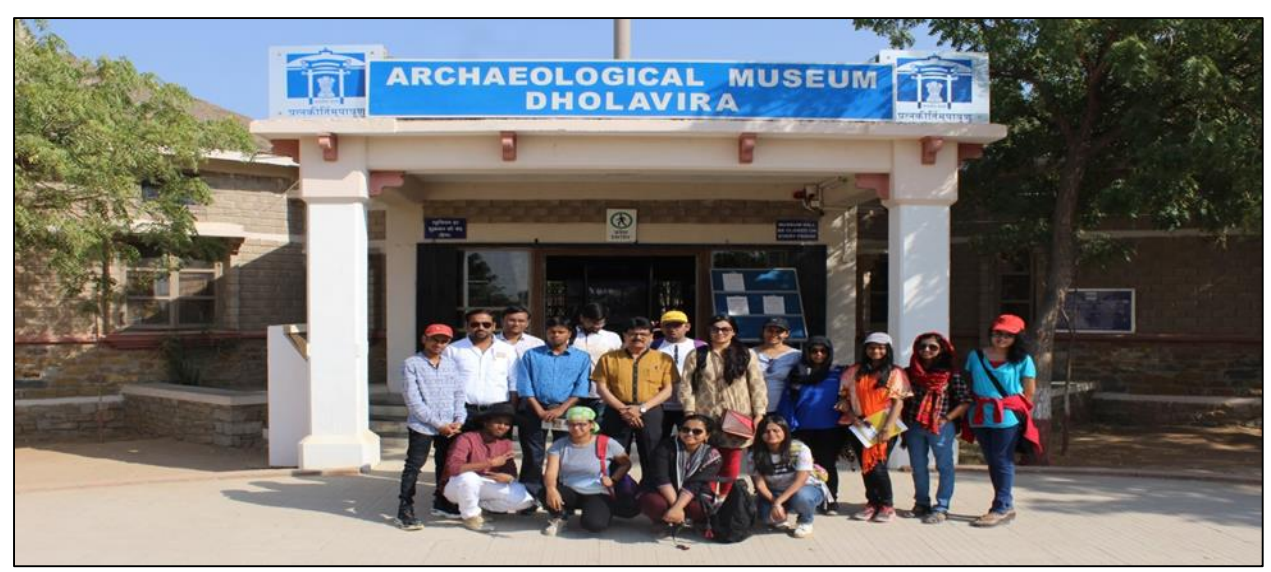
Fig. 7: Archaeological museum of Dholavira