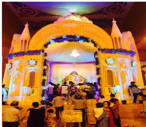
Fig. 6: Decorative Pandals

Clay is from natural source and is easily soluble in water. Material used for making clay idols contains the clay popularly called "Shadu" now a day's mostly sourced from Gujath. Other material like starch etc. and colors used are mostly natural / eco-friendly, except for the Golden color. Due to disintegration of Hindu undivided families and urbanization demand of house hold idols is increased. This has increased demand of 'Shadu Clay', which is not easily available resulting into increased cost of Ganesh Idols made from Shadu Clay. Since, these idols get rapidly dissolved in water turbidity of water tends to increase immediately. "Eco-Ganesh" idols are made up of Shadu Clay and Paper pulp, Natural gum, eco-friendly colors and natural coir from palm / coconut tree. These idols have advantage of light weight, close to traditional belief and having lesser metal contents. The idols have benefit of easy disintegration in water.