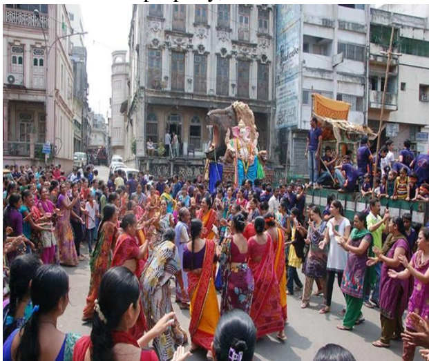
Fig. 5: Crowd at Time of Ganesh Utsav

Colors used are mostly chemical and contain metals such as Copper, Chromium, Cadmium, Nickel, Lead, Mercury etc. POP makes water alkaline if deposited excessively. Calcium and magnesium concentration in water increases significantly leading to an increase in the hardness of water. Clay (Shadu) Traditionally, Ganesh Idols are made up of clay from bank of river. Natural clay was widely used for preparation of Idol but making idol from clay is a very skillful job. These clay idols are fragile, and hence limit transportation over longer distance. Due to this property, it is used in molds.