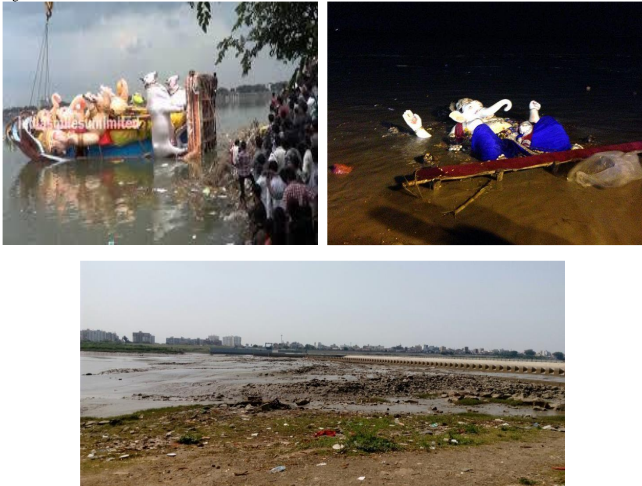
Fig. 7: Condition of Water Body After Immersion Activity

III effect of the celebrations practice causes river pollution. It disturbs the ecological balance by polluting the water from microorganism to man.